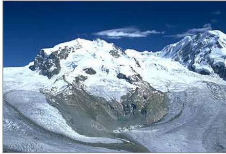
Switzerland Peak Dufour 4634 m