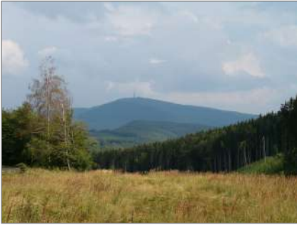
Hungary Kékestető 1014 m